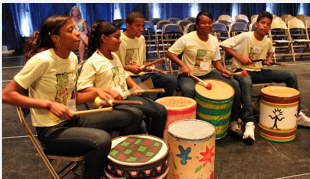
THE CHILDREN FROM THE HENRY FORK SERVICE CENTER AND THE VISITING BRAZIL CHILDREN MARCHED TO THE STADIUM TO "JESUS LOVES THE LITTLE CHILDREN" AND SANG SONGS IN ENGLISH AND PORTUGUESE FOR THE CONFERENCE MEMBERS AND GUESTS.