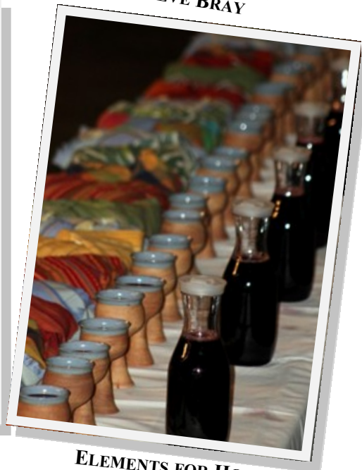
ELEMENTS FOR HOLY COMMUNION