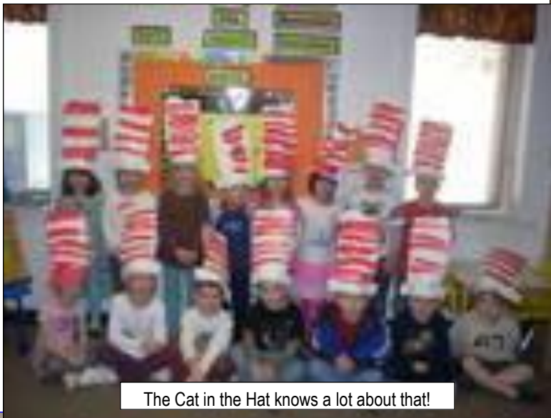
The Cat in the Hat knows a lot about that!