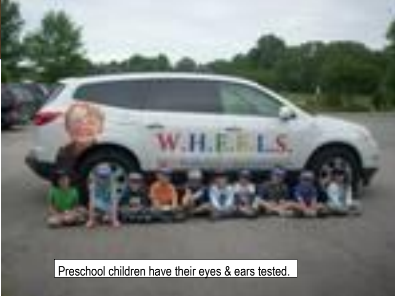
Preschool children have their eyes & ears tested.