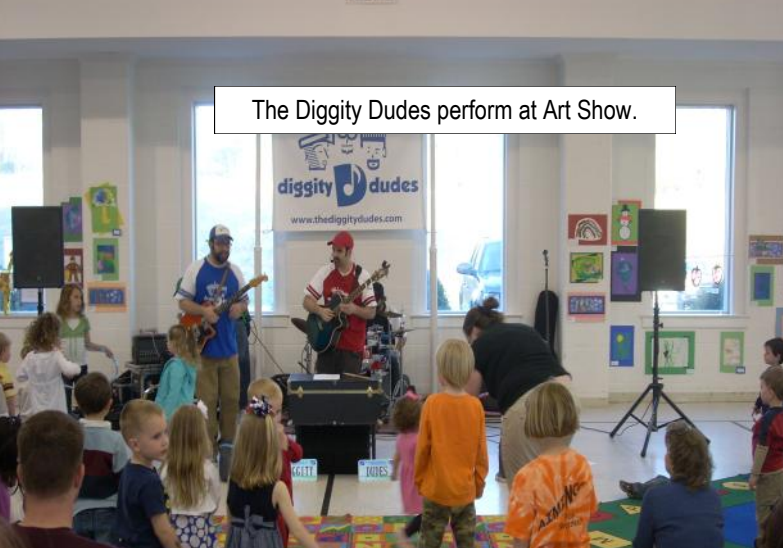
The Diggity Dudes perform at Art Show.